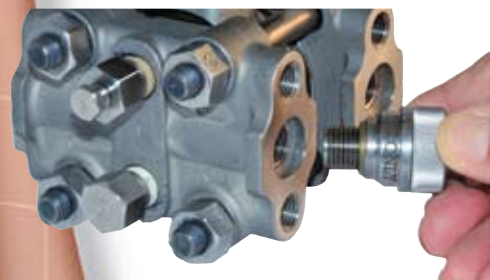
1/4" IEC Transmitter Ports Compatible to 1/4" (IEC 61518) 2.126 (54) process flange ports