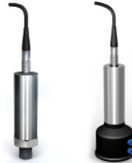
Gauge pressure Differential pressure