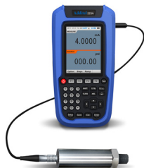
Additel 223A with ADT160A Pressure Module