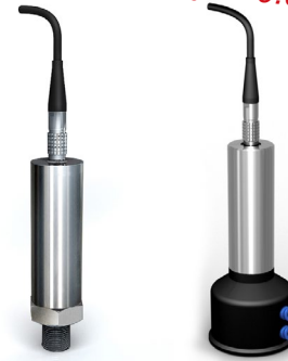
Gauge pressure Differential pressure

New Precision Accuracy Models with 1-Year Uncertainty to 0.01% of Reading