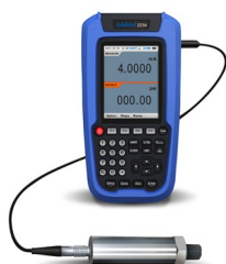
Additel 223A with ADT160A Pressure Module