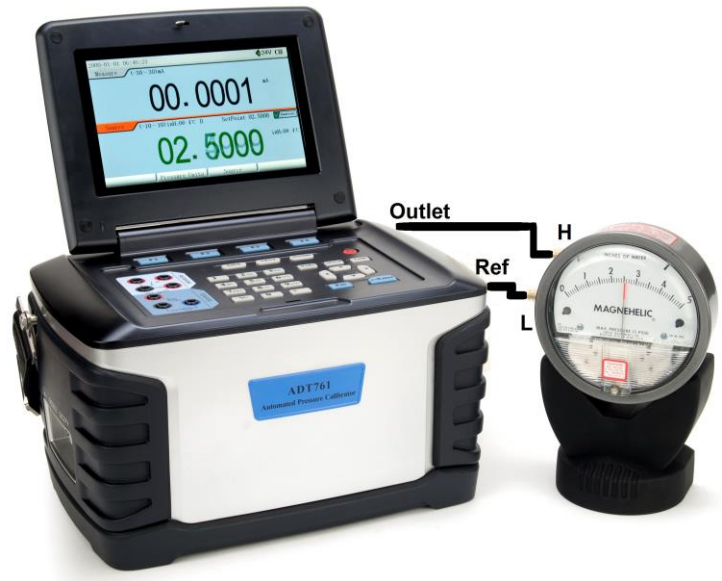
Figure 4 ADT761 calibrator with DUT