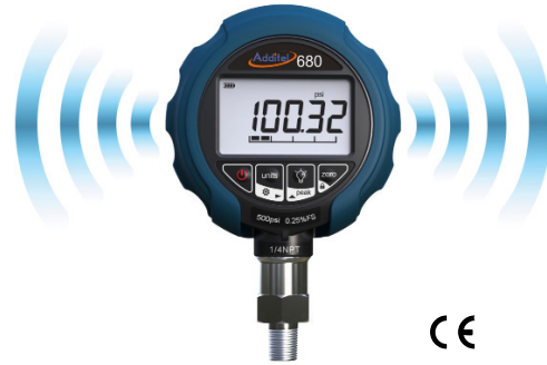
680 with data logging and wireless (optional)