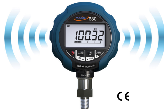
680 with data logging and wireless (optional)